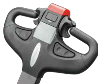
The modular tiller is simple but reliable, All parts inside can be replaced separately and all operations can be performed single handedly

Easy engine access is very convenient for the maintenance of the entire machine. All rotating shafts are equipped with a lubricating sleeve and oil cup, which is convenient for maintenance