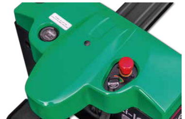
Beautifully moulded with sleek compact design for effortless operation and use in confined spaces