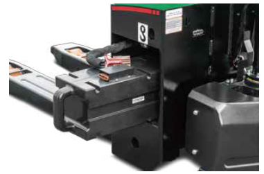
Easy battery access and exchange