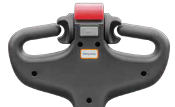
The upright-tiller running function allows continuous operation in confined spaces like containers

The SRH Series 1.5t & 2t Mini Lithium-ion Pallet Trucks have been redesigned and have a slick modern industrial design appearance. The ultra-smooth lines and compact profile reflect ultra high tech design with special attention to the ergonomics